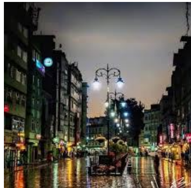
M.G Marg, Gangtok