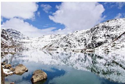
Tsonmgo Lake, Gangtok