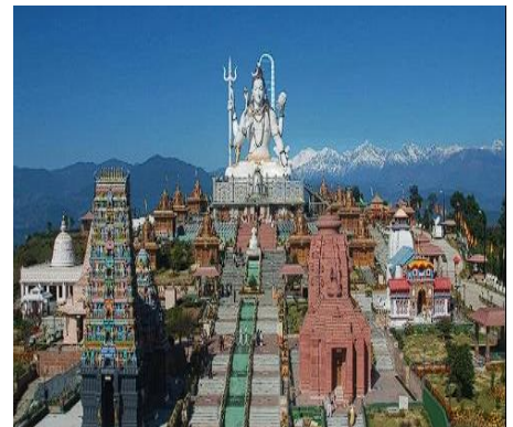
Char Dham, Namchi