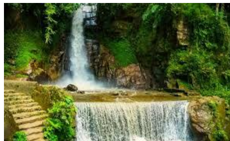
Banjharki Falls, Gangtok