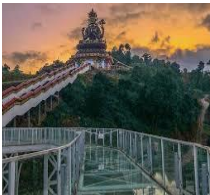
Pelling Sky Walk